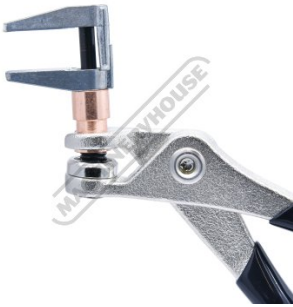
Shown with Optional Cleco Fastener Pliers H8500