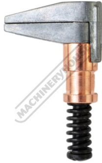
Side Grip Clamp