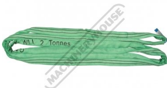
H312 Round Sling