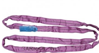
H308 Round Slings