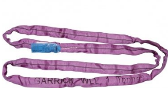
H305 Round Slings