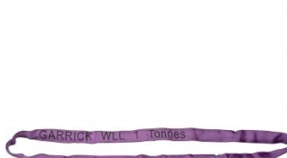
H300 Round Slings