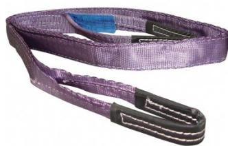
H318 Flat Slings