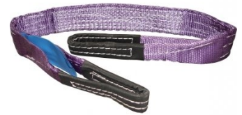
H316 Flat Slings