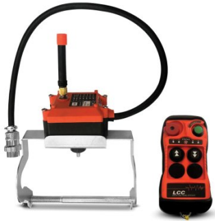
H258A Wireless remote t/s builders hoist