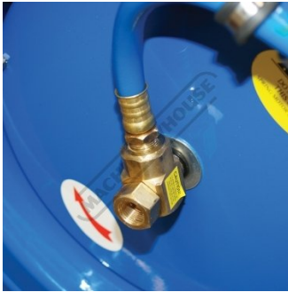
Side Air Inlet