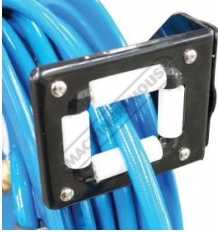
4 Way Roller Guide