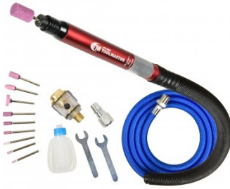
A043 Air Micro Die Grinder Kit