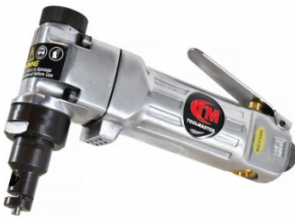
A082 Air Nibbler