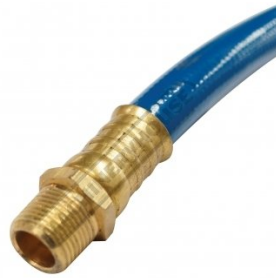
Air Hose Fitting