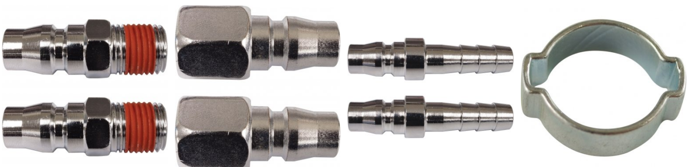
F888 Air Fittings