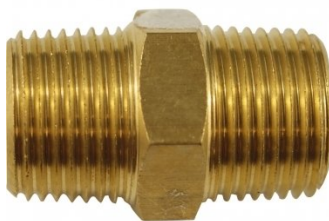
F864 Air Fittings