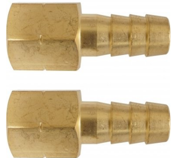
F811 Air Fittings