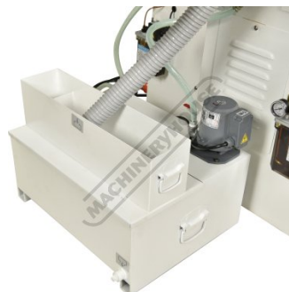
Coolant Pump and Tank