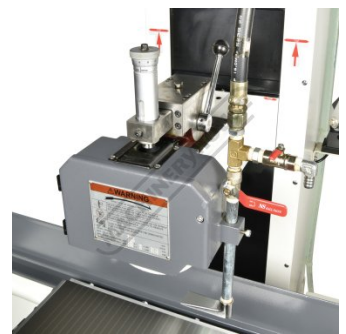
Grinding Wheel with Coolant System