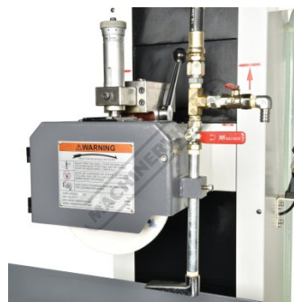
Grinding Wheel Enclosure Guard