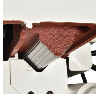
Large Table Vee Slide with Turcite B Coating