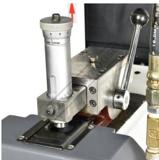
Wheel Dresser with Micro Adjustment