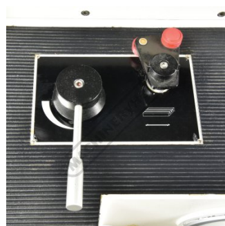
Hydraulic Table Feed Control