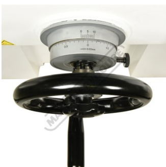
Cross Feed Dial