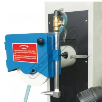
Wheel Coolant Nozzel