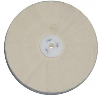
G186A Buffing Mop