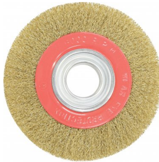
G187 Grinder Wire Wheel - Crimped