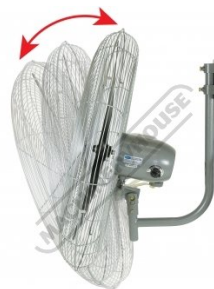
Tilt Head 30°