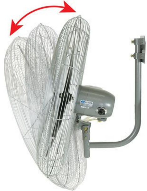
Tilt Head 30°