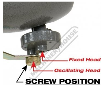
Fixed or Oscillating Screw Position