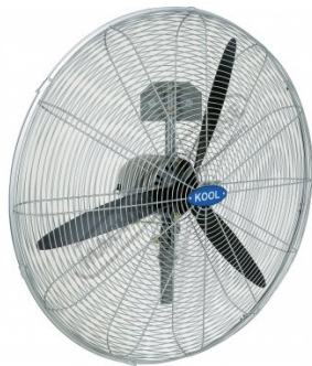
Oscillates 90 Degrees Right View