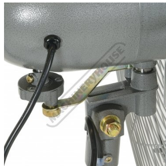
Oscillating Head Release Screw