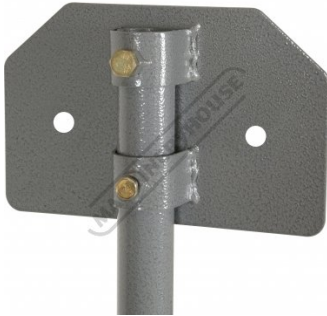
Wall Mounting Bracket