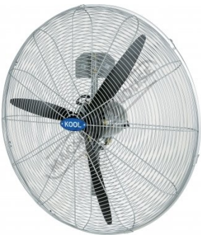
Oscillates 90 Degrees Left View