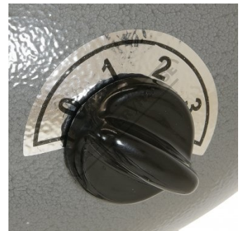
3 Fan Speeds