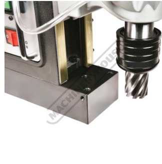
Quick Release Chuck (Cutter Not Included)