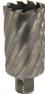
D9576 HSS Drill Broach Cutter