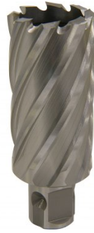
D9570 HSS Drill Broach Cutter