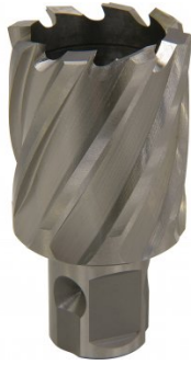
D9532 HSS Drill Broach Cutter