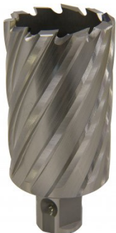
D9578 HSS Drill Broach Cutter