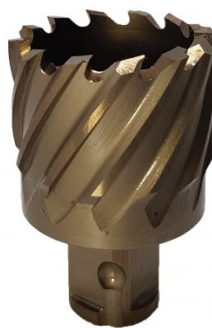
D940 HSS-Co (5% Cobalt) Drill Broach Cutter