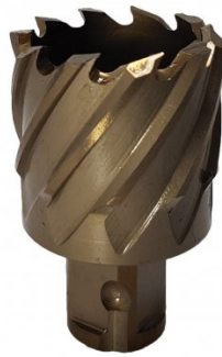
D936 HSS-Co (5% Cobalt) Drill Broach Cutter