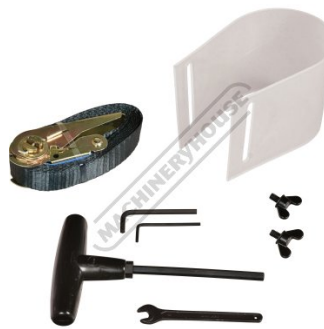
Tooling and Parts