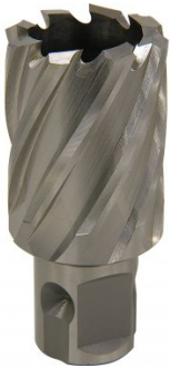
D9528 HSS Drill Broach Cutter