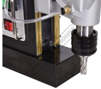
Quick Release chuck Cutter Not Included