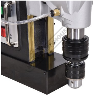
Includes Drill Chuck