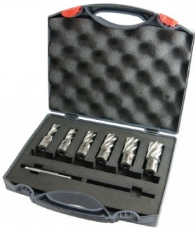
D109 HSS Broach Drill Set - 6 Piece