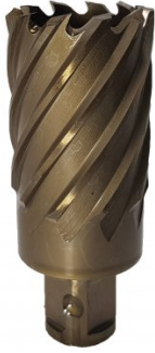
D935A HSS-Co (5% Cobalt) Drill Broach Cutter