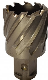
D934 HSS-Co (5% Cobalt) Drill Broach Cutter