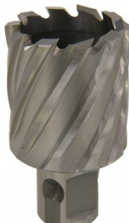
D9535 HSS Drill Broach Cutter