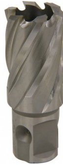
D9523 HSS Drill Broach Cutter