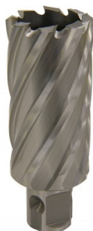
D9570 HSS Drill Broach Cutter