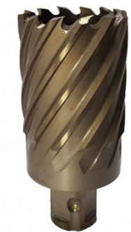
D938A HSS-Co (5% Cobalt) Drill Broach Cutter