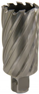
D9574 HSS Drill Broach Cutter