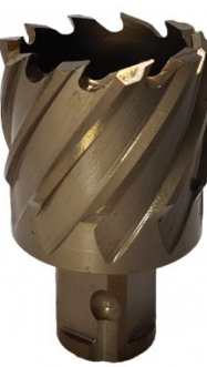
D936 HSS-Co (5% Cobalt) Drill Broach Cutter