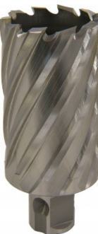
D9576 HSS Drill Broach Cutter