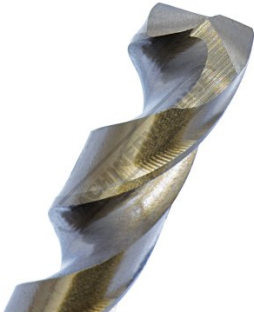
135° Split Point - M35 Grade HSS 5% Cobalt