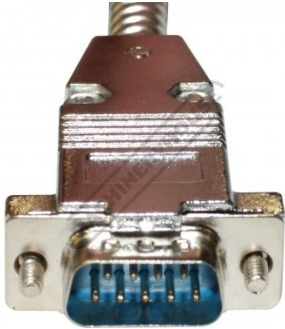
DSub9 Male Plug