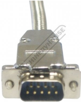
DSub9 Male Plug