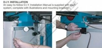
DIY INSTALLATION An easy-to-follow DIY Installation Manual is supplied with each system, complete with illustrations and mounting brackets.