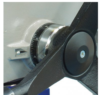
Drilling Depth Stop Setting With Scale