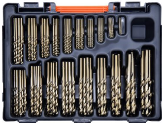
D126 Metric 135° Precision HSS Drill Set - 170 Pieces