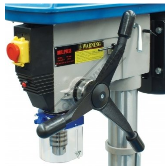
1 Piece Cast Iron Drilling Lever