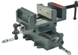
V1204 Compound Drill Vice