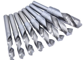
D117 Metric HSS Reduced Shank Drill Set