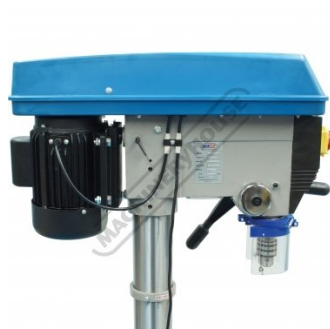
Head Side View