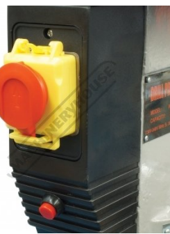
Emergency Stop Switch and Light Switch