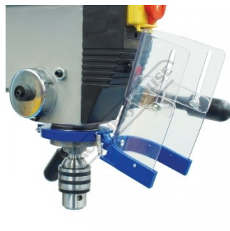
Safety Chuck Guard Flipped Up