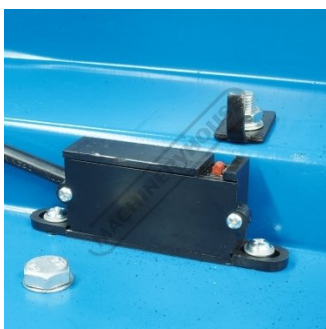
Safety Micro Switch on Pulley Guard