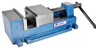
V141 Safeway Precision Drill Press Vice