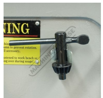
Chuck Key Holder