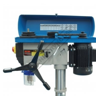
A Section Belt Drive System