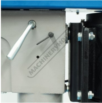
Belt Tension Lever and Lock