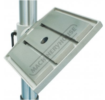
Tilting and Rotating Cast Iron Table