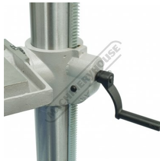
Table Height Adjustment Crank