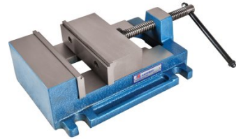
V143 Safeway Precision Drill Press Vice