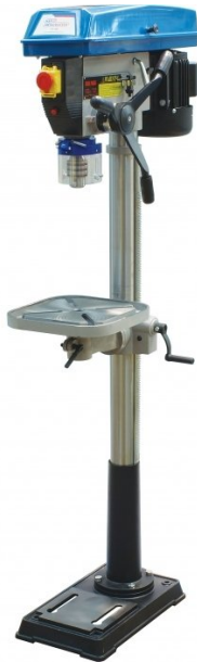
Table Tilts Left & Right To 45° & Rotates 360° Ø20mm Drill Capacity with 2MT Spindle Taper