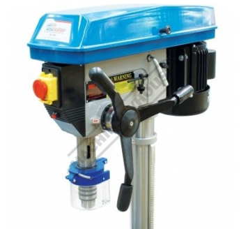
80mm Spindle Travel