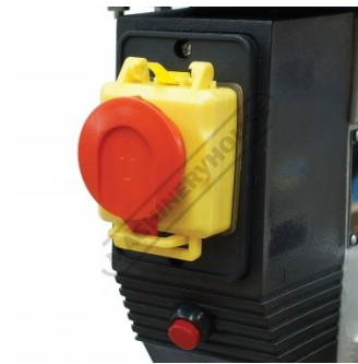
Emergency Stop Emergency Switch and Light Switch