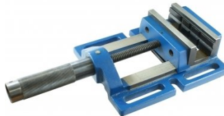
V145 Drill Press Vice