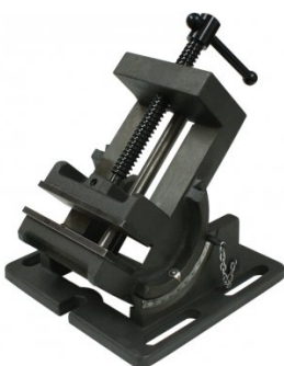
V114 Tilting Drill Press Vice