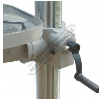
Table Height Adjustment Crank