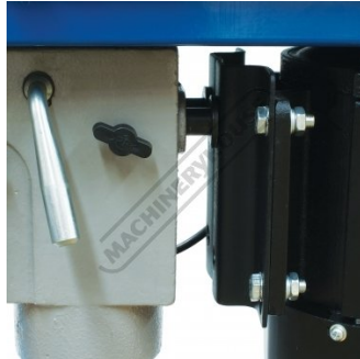
Belt Tension Lever and Lock