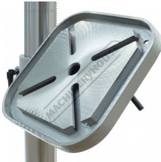
Tilting and Rotating Cast Iron Table