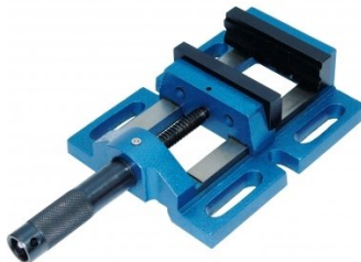
V144 Drill Press Vice