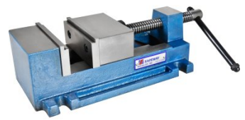
V141 Safeway Precision Drill Press Vice