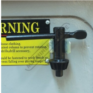
Chuck Key Holder