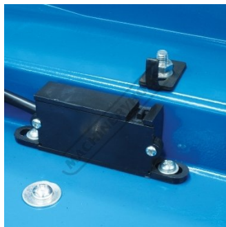
Safety Micro Switch on Pulley Guard