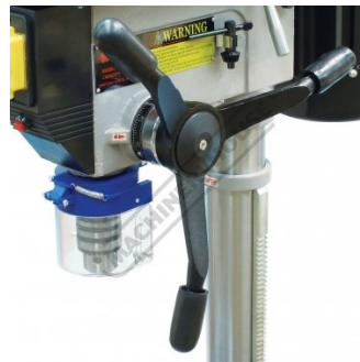
1 Piece Cast Iron Drilling Lever