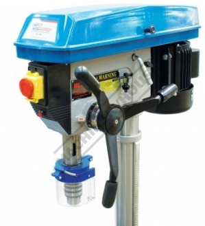
80mm Spindle Travel