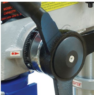
Drilling Depth Stop Setting With Scale