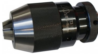
C294 Industrial Drill Chuck - Keyless Type