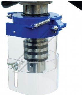
Adjustable Safety Chuck Guard with Flip Up Screen