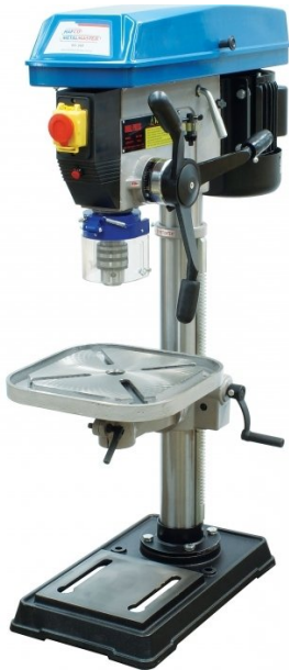
Table Tilts Left & Right To 45° & Rotates 360° Ø20mm Drill Capacity with 2MT Spindle Taper