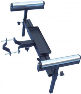
W3425 Drill Press Roller Support