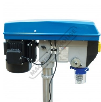
Head Side View