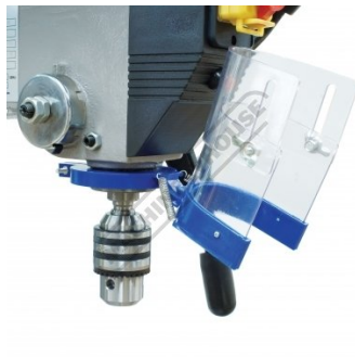
Safety Chuck Guard Flipped Up