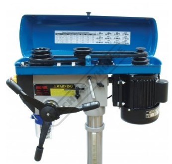
A Section Belt Drive System