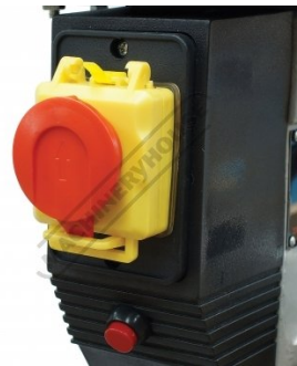
Emergency Stop Switch and Light Switch