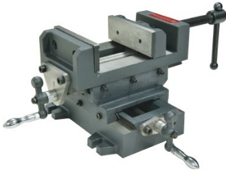
V1205 Compound Drill Vice