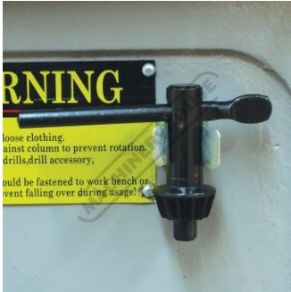
Chuck Key Holder