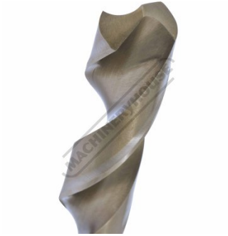
135 Degree Split Point M35 HSS 5% Cobalt