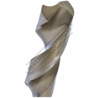
135 Degree Split Point M35 HSS 5% Cobalt