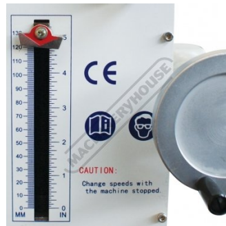
Adjustable Accurate Depth Setting For Increased Productivity