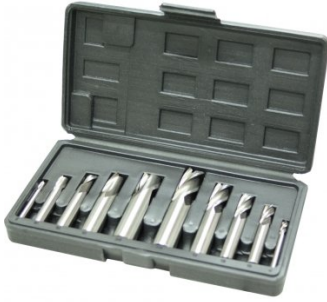
M3301 Metric HSS Slot Drill & End Mill Set - 10 Piece