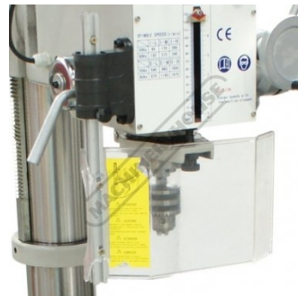
Swivel Safety Drilling Chuck Guard