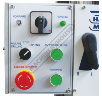
Emergency Stop Switch and Overload Protection and Tapping Function