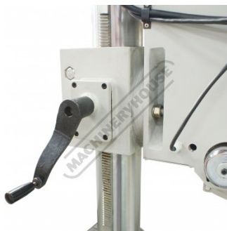
Rack and Pinion Wind Up Drill Head