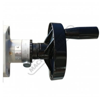
Table Longitudinal Travel Handle