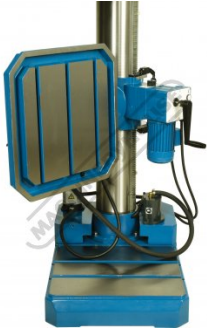
Swivel and Tilting Table