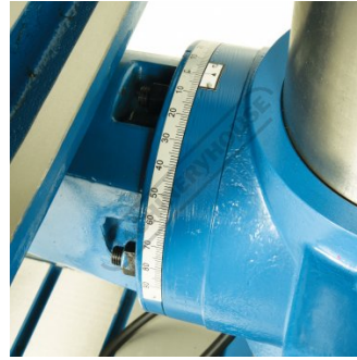
Table Tilt Adjustment Graduations