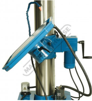
Table Tilts 90 Degrees Left or Right - shown at 45 degrees