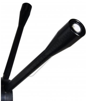
Electronic Feed Engagement