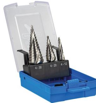
D107 HSS Step Drill Sets