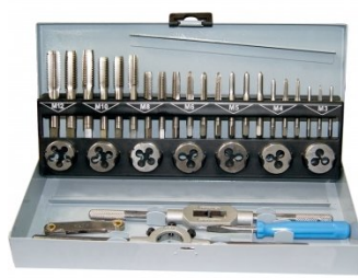
T014 Metric Alloy Steel Tap & Die Set - 45 Piece