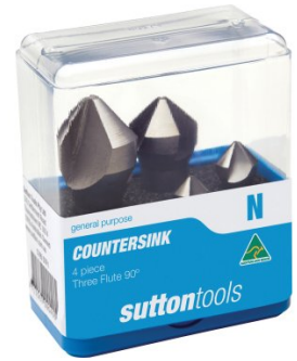
D106 Countersink Sets – 90° Three Flute