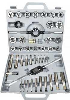
T015 Imperial Alloy Steel Tap & Die Set - 45 Piece