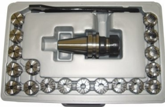
C929A Collet & Chuck Set - 20 Piece