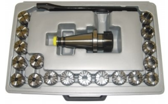
C929 Collet & Chuck Set - 20 Piece