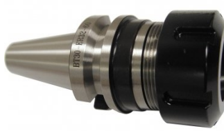
T332 BT30 x ER32-60 Collet Chuck