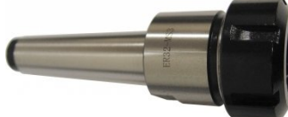
C105 Collet Chuck - 3MT x ER32