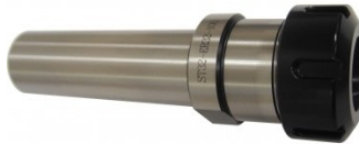
C931 32 x 100 x ER32 Collet Chuck - Straight