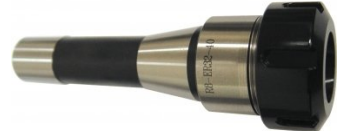
C106 Collet Chuck - R8 x ER32