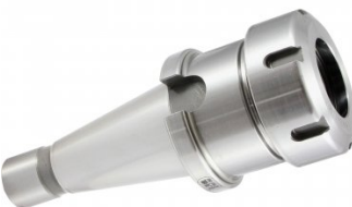
C110 Collet Chuck - NT30 x ER32