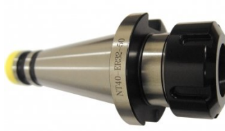
C112 Collet Chuck NT40 - ER32