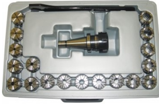
C928 Collet & Chuck Set - 20 Piece