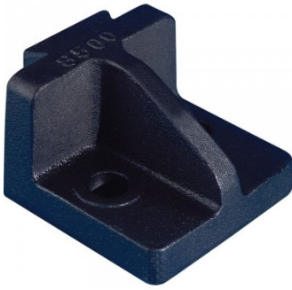
A358C Bolt Down Adaptor