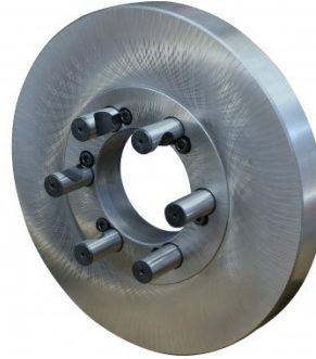
L289 D1-6 Camlock Back Plate