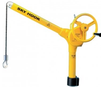
A358 Sky Hook Lifting Device