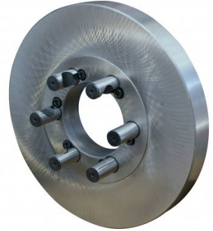
L286 D1-8 Camlock Back Plate