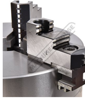
Jaw Rear View