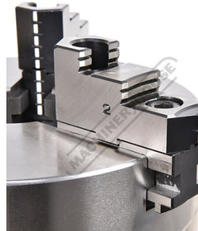
Jaw Rear View