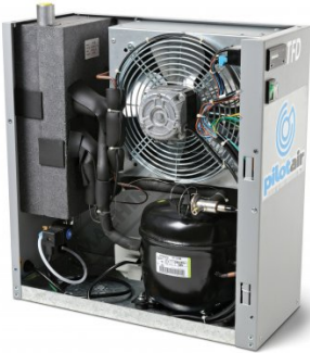
Side Case Open