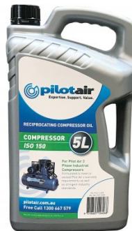
C346 ISO 150 Air Compressor Oil