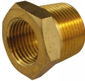
F842 Air Fittings