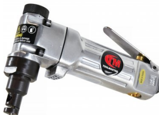
A082 Air Nibbler