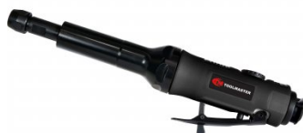
A041 Air Die Grinder - Extended Shaft 5" (127mm)