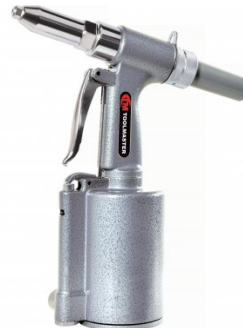
A046 Air Pop Rivet Kit