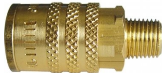
F901 Air Fittings