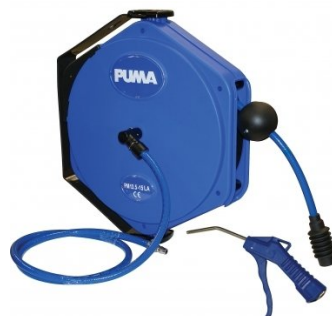
H040 Industrial Retractable Air Hose Reel