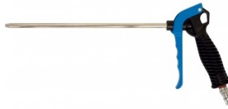
A251 Hi Flow Air Duster Gun