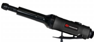
A041 Air Die Grinder - Extended Shaft 5" (127mm)