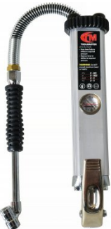
A264 Professional Tyre Inflator with Linear Gauge