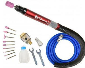
A043 Air Micro Die Grinder Kit