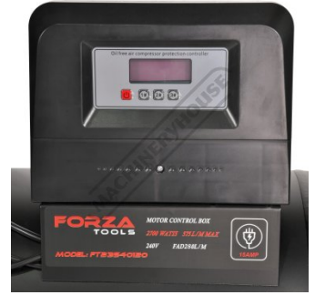
Digital Display & Controls