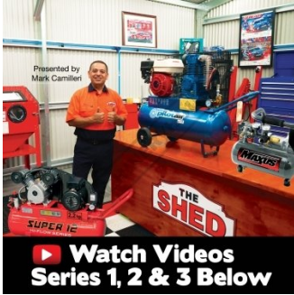
Compressors Watch Video Web Image