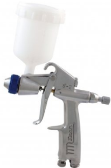
S322 Gravity Feed - Spray Gun