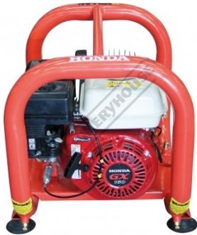
Honda CX 160