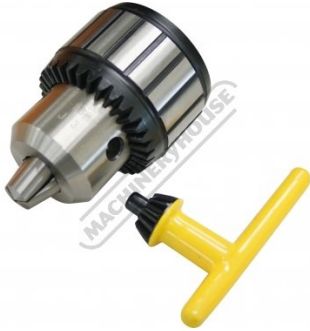
Chuck and Key