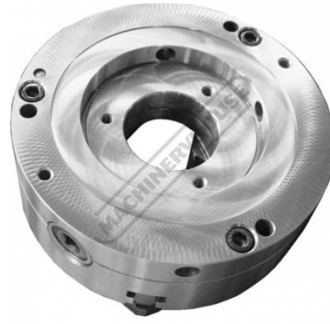
Back of Chuck