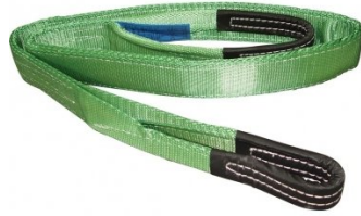
H322 Flat Sling