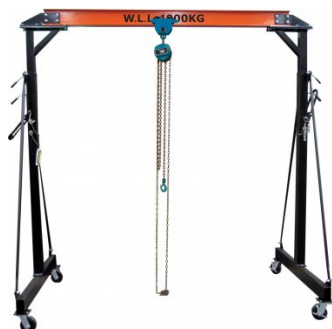
K088 Mobile Girder Rail Gantry Package Deal