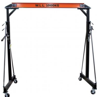
C188 Mobile Girder Rail Gantry