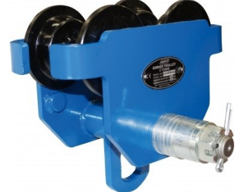
C148 Girder Trolley