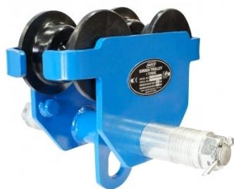
C147 Girder Trolley