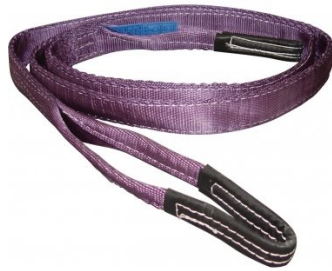
H320 Flat Sling