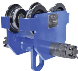
C148 Girder Trolley