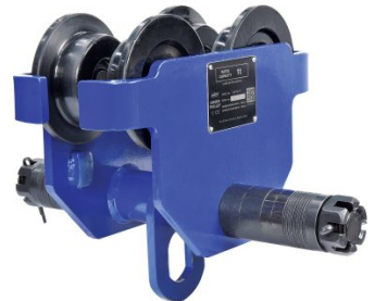
C147 Girder Trolley