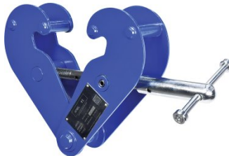
C146 Girder Clamp