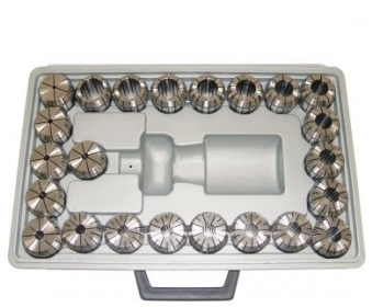
C958 ER40 Collet Set - 23 Piece