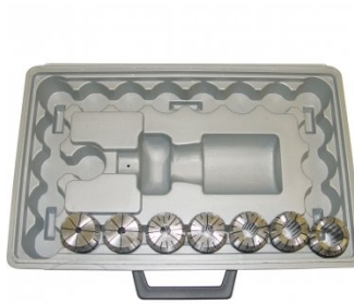
C957 ER40 Collet Set - 7 Piece