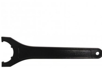
C969 ER40 Collet Chuck Wrench