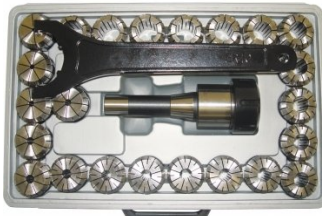
C964 Collet & Chuck Set - 25 Piece