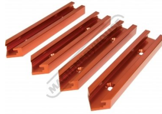
4 Piece Set Front View