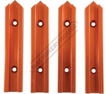
4 Piece Set Top View