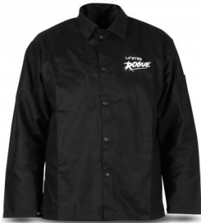
W1003 ROGUE™ PROBAN® Welding Jacket