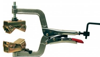
W1014 Pipe Plier - Large