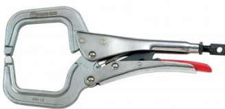
W1016 Locking C-Clamp - Round Tip