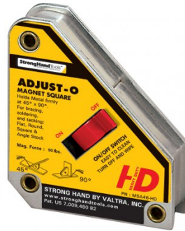
W1007 Adjust-O Magnet Square - Heavy Duty