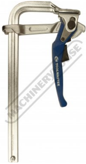
Shown Fully Closed