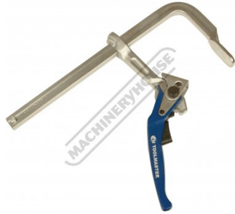
Shown with Ratchet Fully Open