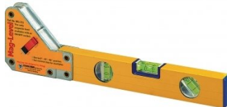
W1020 Magnetic Level