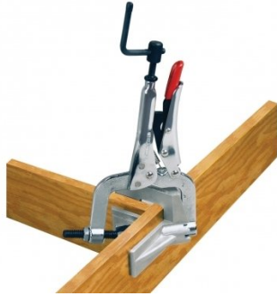
W1013 Corner Clamping Plier