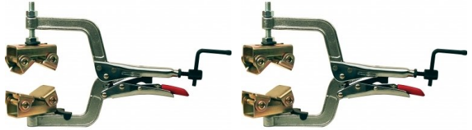
W1015 Pipe Plier